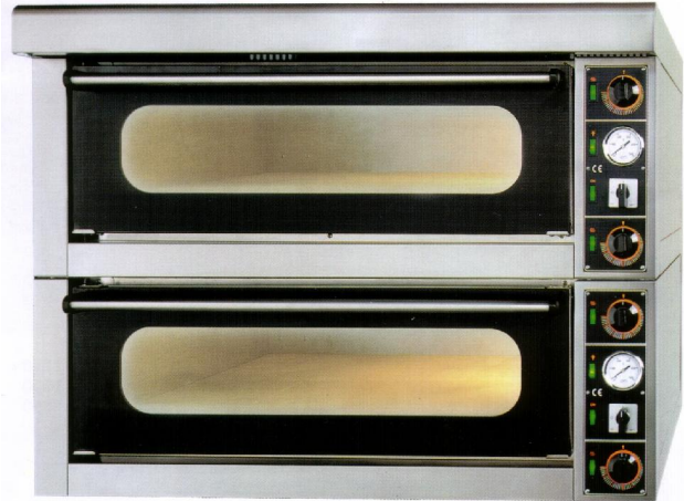
Double module with hood