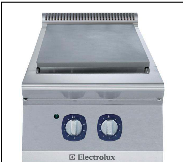
Modular Cooking Range Line 700XP Electric Hob Cooking Top 400 mm

371027 (E7HOED2000) Half module electric hob cooking top